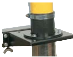
Table bracket MM-005 (accessory) on standard mounting bracket.

The Miniman has a gas spring supported shoulder joint (standing) and an elastic bungee cord (hanging) for smooth operation. The easily adjusted arm joints are fully external for unobstructed airflow. Universal mounting bracket is standard.