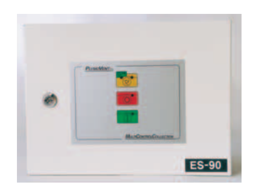
PlymoVent offers you a clean working environment at the right price.

advantage of the ES-90. Just add Control Unit M-1000 for the central duct propeller fan and your system will be fully automatic.